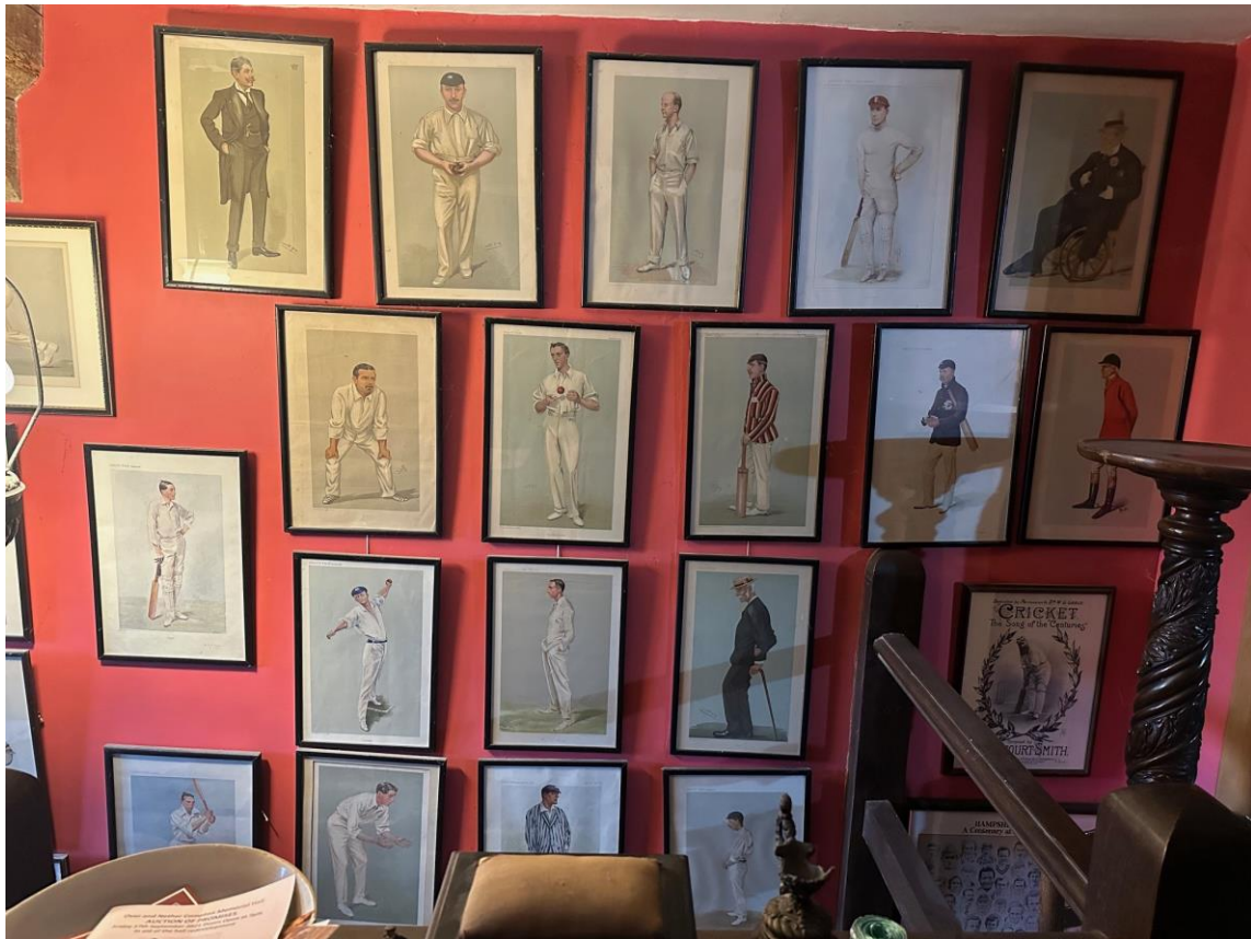
Some of the cricket prints hung in the house