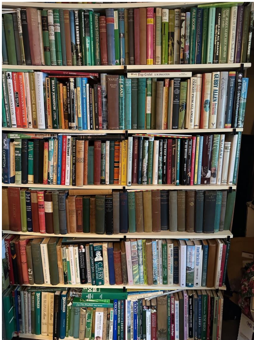
Part of the library of cricket books in the house

In the cricket memorabilia collection, which is all being sold without reserve, there are pottery figures, pictures, balls, bails and a vast library of specialist cricket books including a complete run of the famous Wisden Cricketers Almanacks dating from 1864 to 2021.