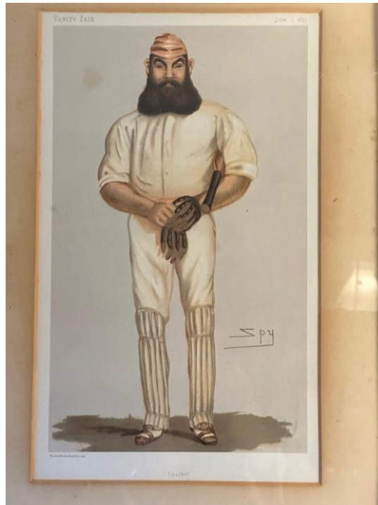
Vanity Fair print of W G Grace

There are hundreds of lots from the collection which Charterhouse expect to sell for well over £10,000.