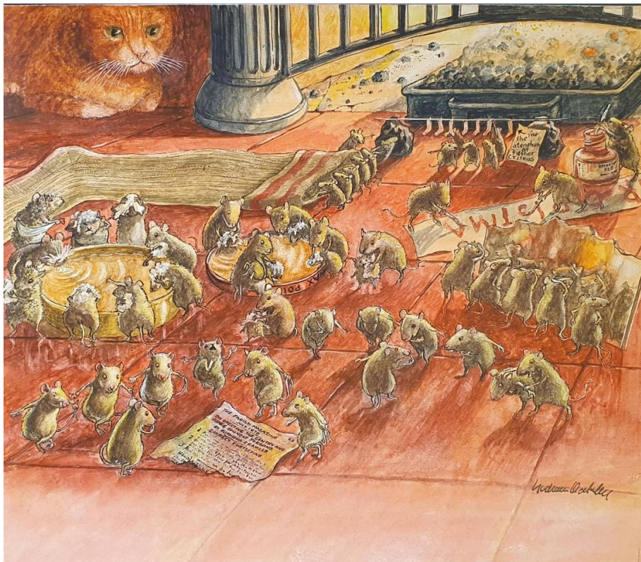
Sampson the Cat and the Church Mice from the Graham Oakley Studio unreserved auction on 27th September