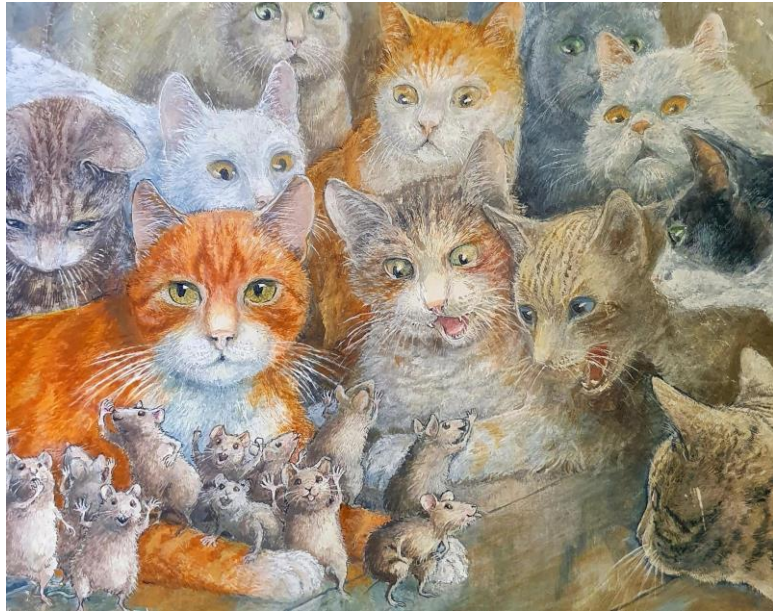
Sampson the Cat and the Church Mice from the Graham Oakley Studio unreserved auction on 27th September