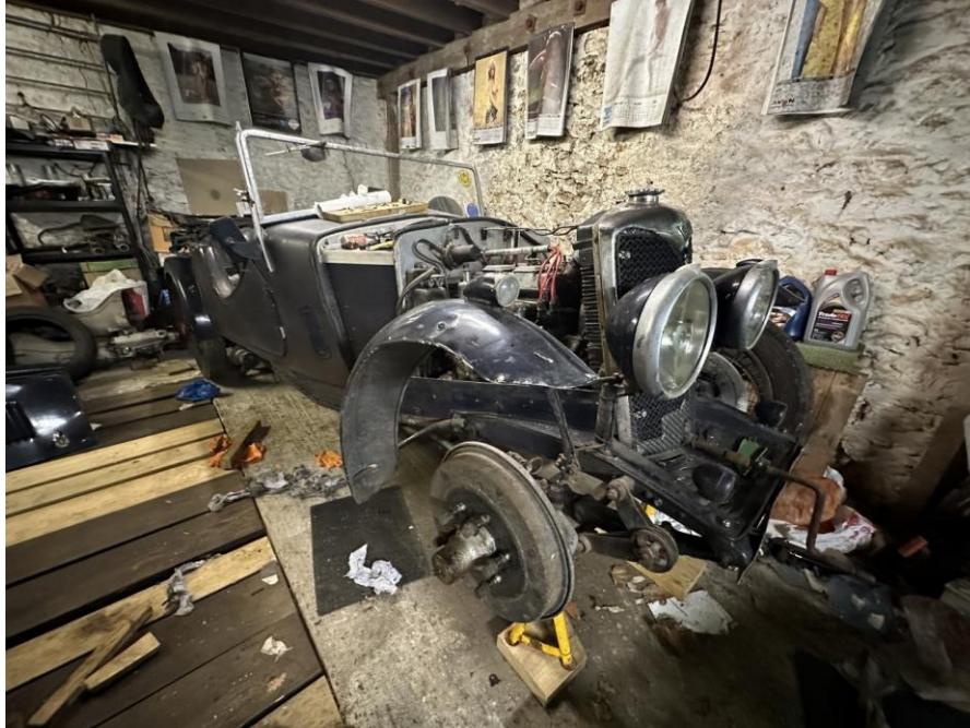
1933 Riley 9 Tourer project found in the corner of a barn

Also from the estate, there are a Bristol 401, Alvis 12/50 TJ DHC also family owned from new, Riley 9 Tourer, Triumph TR3 & TR4, Land Rover Series IIA, Morris Traveller, other cars, vintage tractors, farm bygones and even a Victorian shepherd's hut.