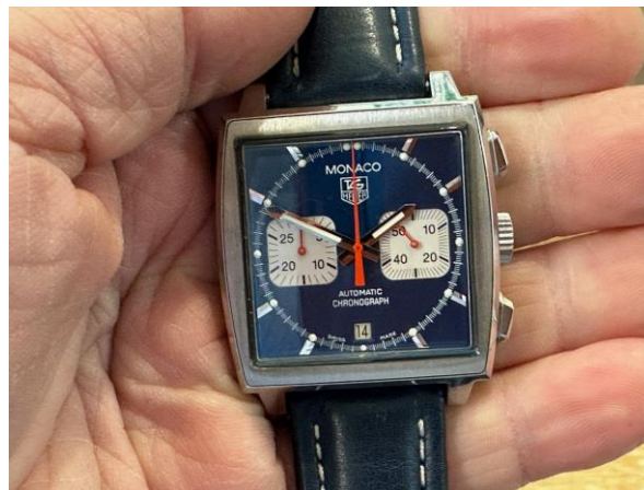
A Tag Heuer Steve McQueen wristwatch

The auctions start off with a specialist sale of Rolex, Omega, Tag Heuer, Jaeger-LeCoultre, IWC and other wristwatches on Wednesday 3 rd at 10am