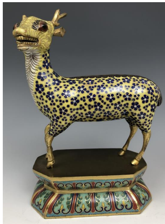
An 18 th century Chinese cloisonné stag

Finally, on Friday 5 th , there are 200 lots of Asian Art with ceramics, pictures and bronzes followed by 100's more lots of antiques & interiors including the residual contents of a 17 th century Dorset cottage.