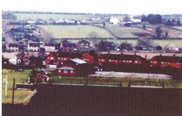
View from East Hill