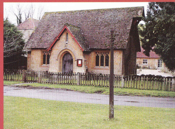
Milborne Wick Church

Countryside walk, Milborne Port and Milborne Wick. Lanes and footpaths – some stiles