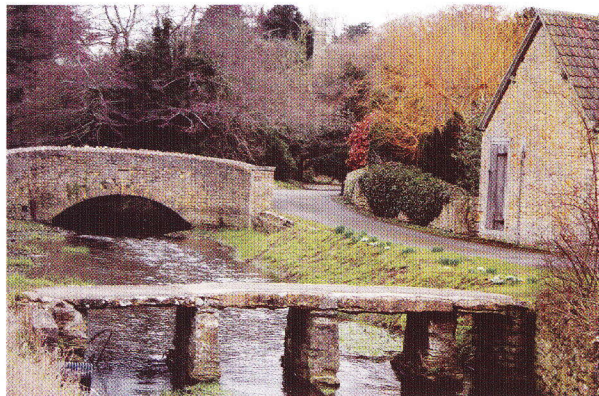
The old footbridge with the 1856 bridge behind

12. TL at the Queens Head into East Street and return to the car park.