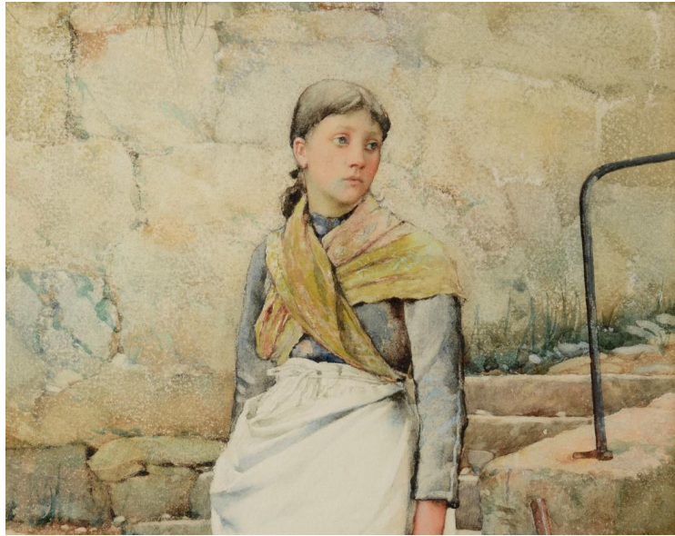
Walter Langley - The Lass Who Loves A Sailor, watercolour, signed, dated 1892 and inscribed Newlyn

The Newlyn School was a colony of artists based in and around Newlyn from the 1880's to the early 20 th century and continues to be a favoured place for artists to paint and live. The Newlyn School artists were fascinated by the fisherman's working life at sea and the everyday life in the harbour and surrounding area.