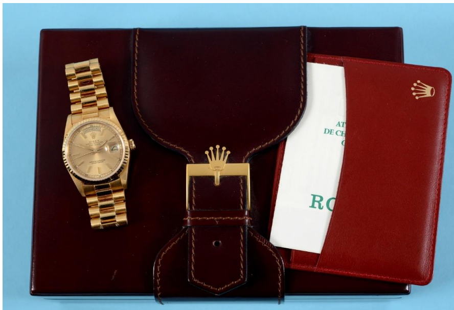
His 18ct gold Rolex