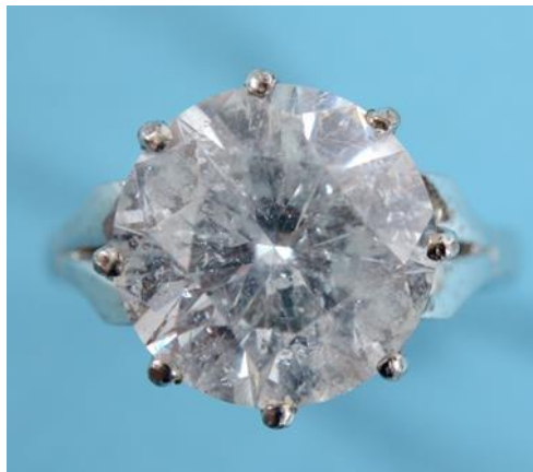
Huge diamond solitaire ring

This is followed by a large diamond solitaire ring, the size of a big fingernail and approximately 6 carat in weight, £14,000 - £16,000. See below:-