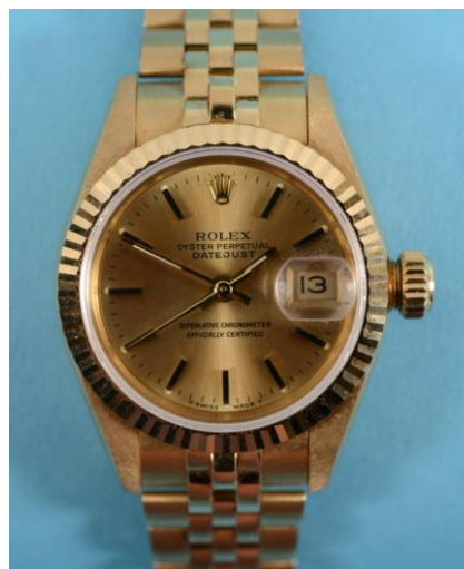
Hers 18ct gold Rolex