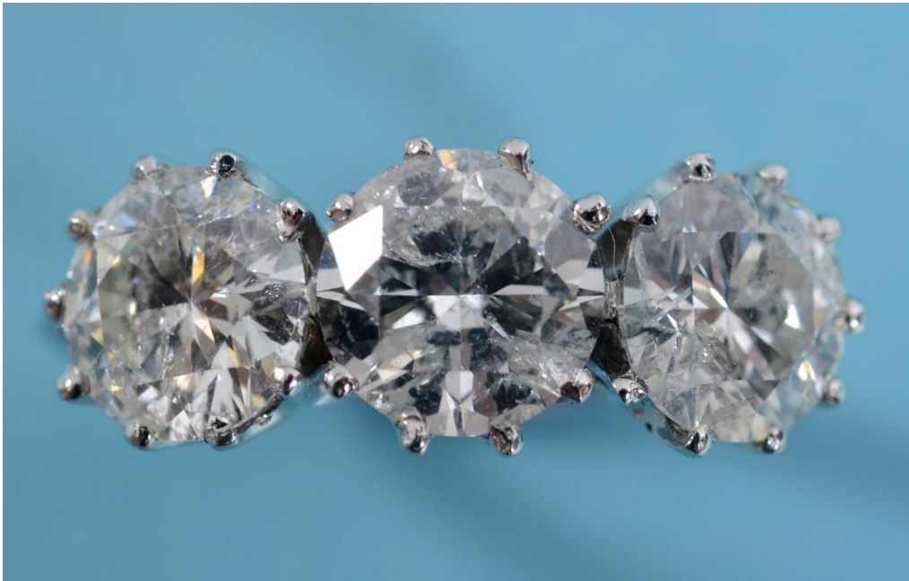
Impressive diamond three stone ring

A large pair of diamond stud earrings £7,500-£8,000, an impressive three stone diamond ring £6,500 - £7,000 and a diamond tennis bracelet, set 50 brilliant cut diamonds, at £4,000 - £4,500.