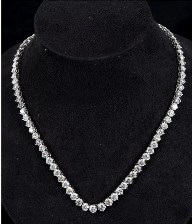
Diamond riviére necklace

Star of the auction is a stunning 18ct white gold riviére necklace. Set with 87 brilliant cut diamonds this design classic is estimated at £30,000 - £35,000.