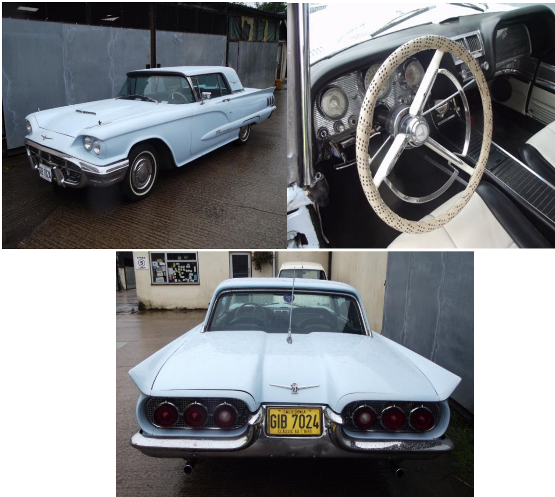
1960 Ford Thunderbird