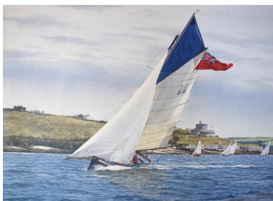
Deliverance off St Mawes