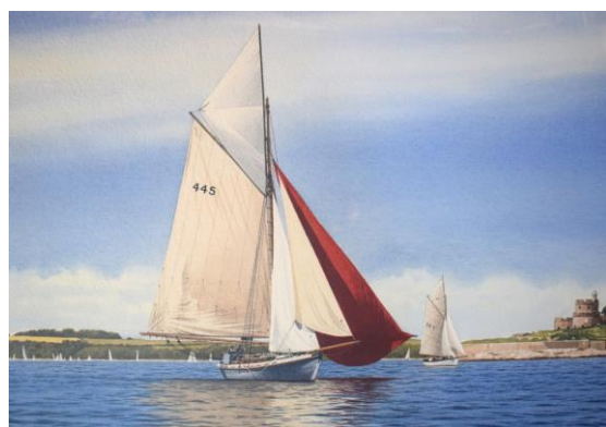
August Sailing off St Mawes