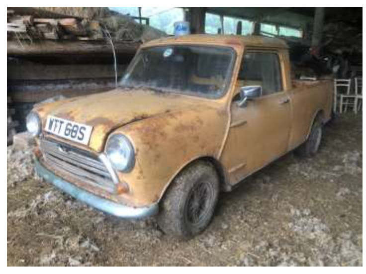
Scruffy and barn stored in

It is a proper barn find Mini which has spent the past 25 years on a sheep farm in deepest Devon. The owner, a farmer all his life, used the pickup on his farm moving feed around and the occasional passenger sheep.