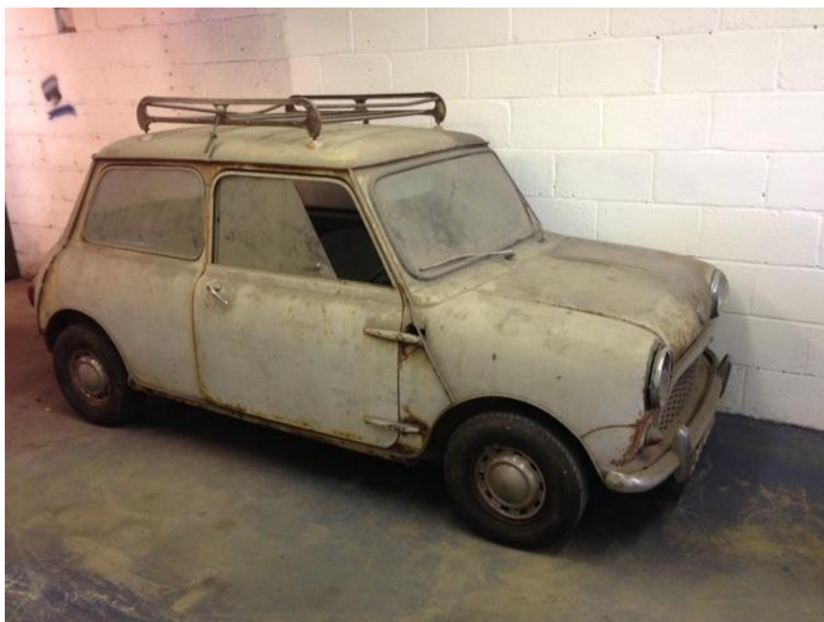
1959 Austin Se7en Mini, original and barn stored £8,000-£10,000

First up is a 1959 Austin Se7en Mini. From the first year of production this Mini has covered just 35,000 miles in 55 years and was last on the road in 1977. Having been barn stored in Devon since 1977, it has gathered a charming covering of dust and is a rare survivor.