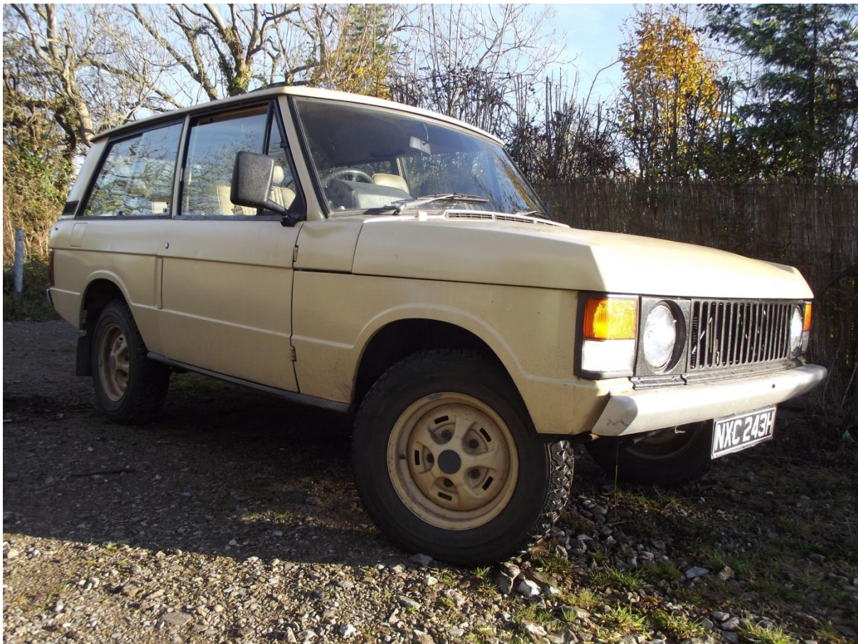
1970 Velar Range Rover, a daily driver £25,000-£30,000

Next up is one of the earliest Range Rover's made. The Range Rover was launched in 1970 and was a success from the start. Now in its fourth generation, early Range Rovers have a large and loyal following. The Charterhouse Range Rover is the 38 th vehicle made by Velar which was a company set up Land Rover to develop the Range Rover and is just 1 of 40 of the Velar Range Rovers made. Despite being such an important early vehicle, it has been well used over the past 44 years, having had the original V8 petrol engine replaced with a more economical Land Rover 300TDi engine, the interior changed and some of the body panels have been replaced. Despite these changes, this is such an early and important Range Rover, that Charterhouse estimates it at £25,000-£30,000 for its Bristol owner.