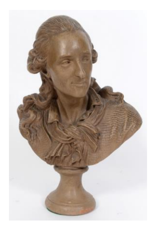
Jean-Antoine Houdon Bust

A terracotta bust of a Frenchman after Jean-Antoine Houdon £200-£300 is also being auctioned.