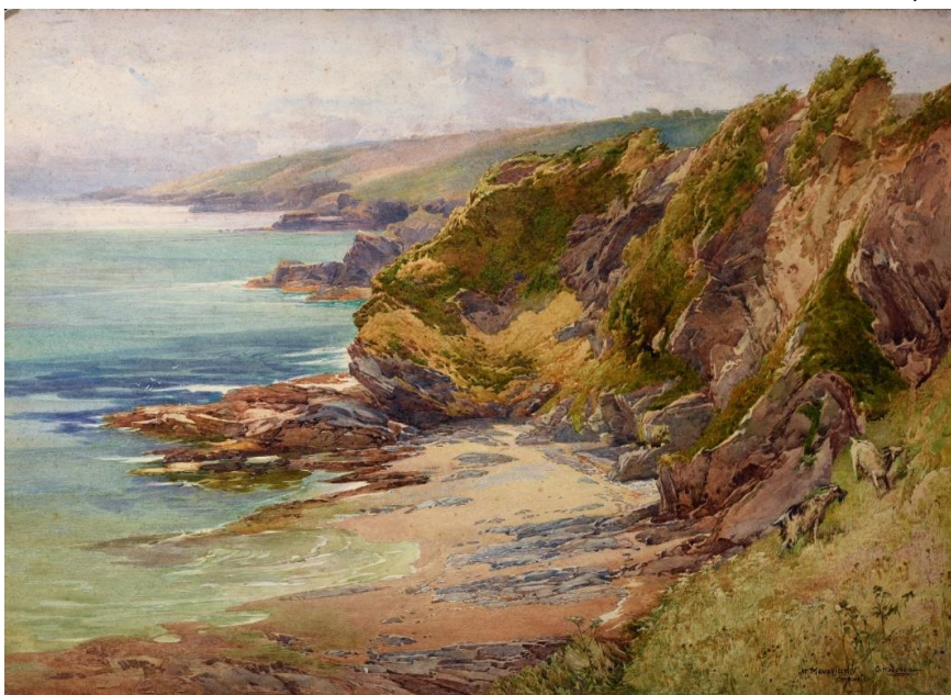
At Mevagissy, Cornwall, watercolour (one of a pair).