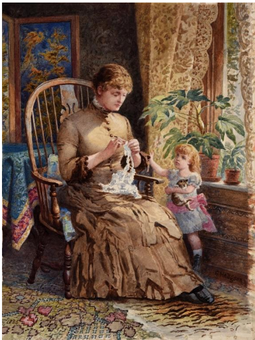
A Lesson in Crochet, watercolour.