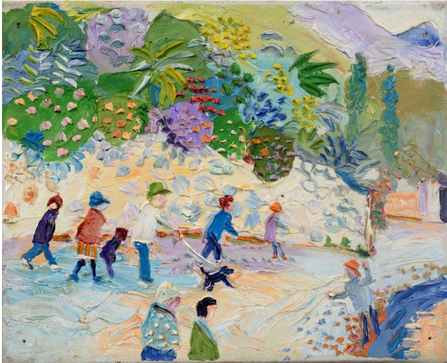
Yates Eze-Sur-Mer (S of France)