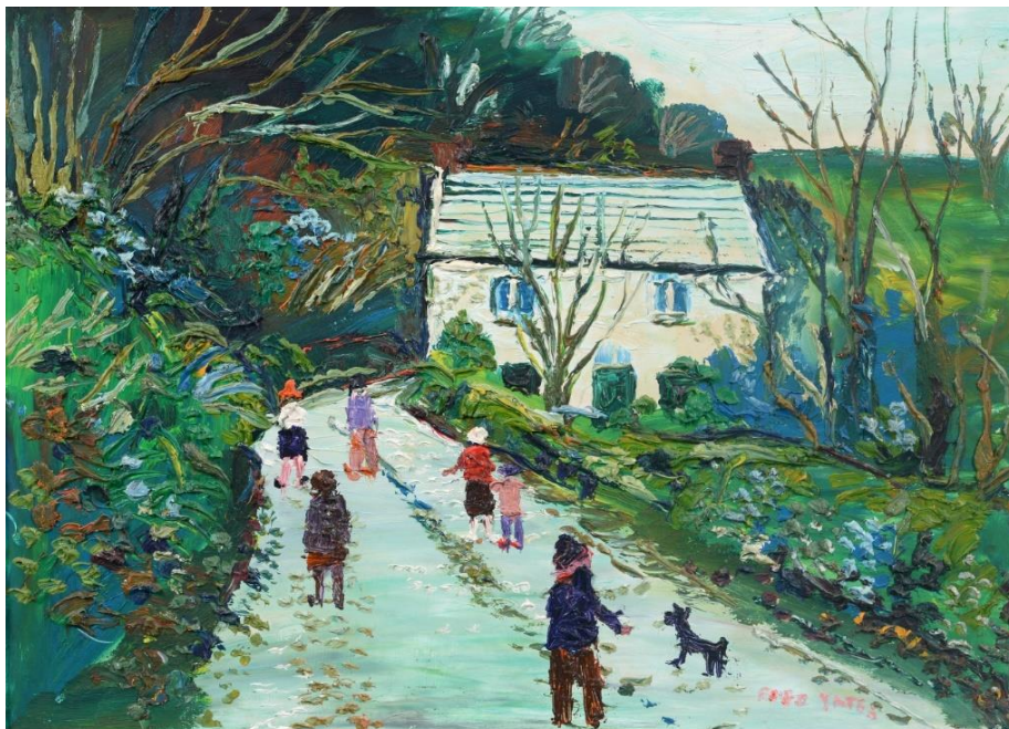
Yates Village land in Winter