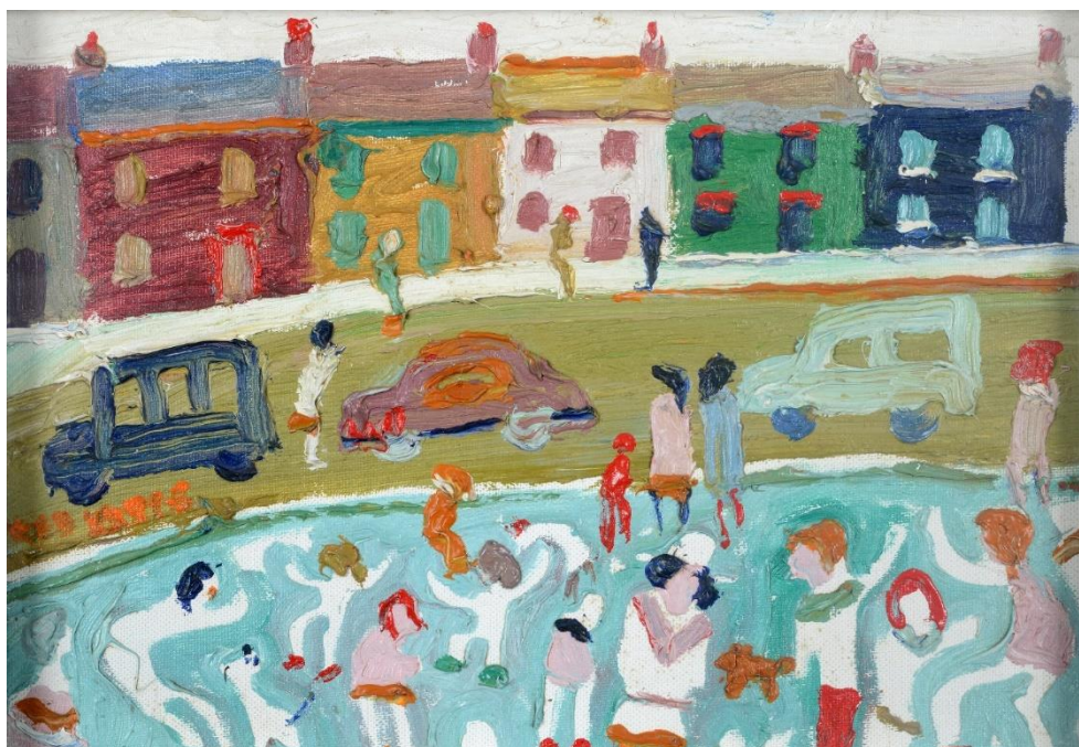
Yates Coastal Town Scene