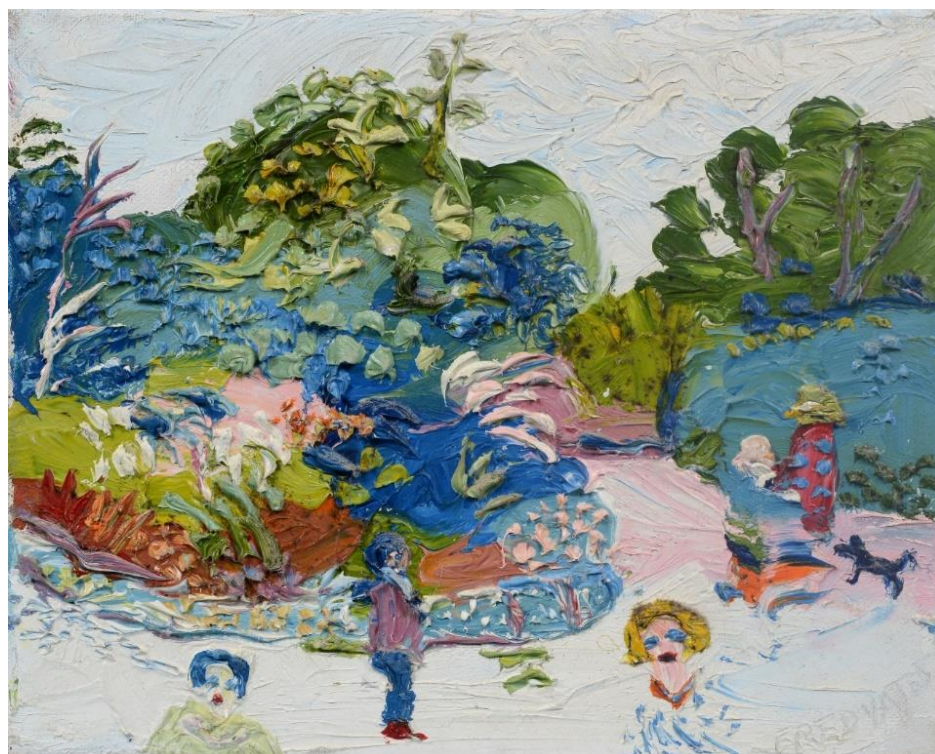
Yates Eze-Sur-Mer (South of France)