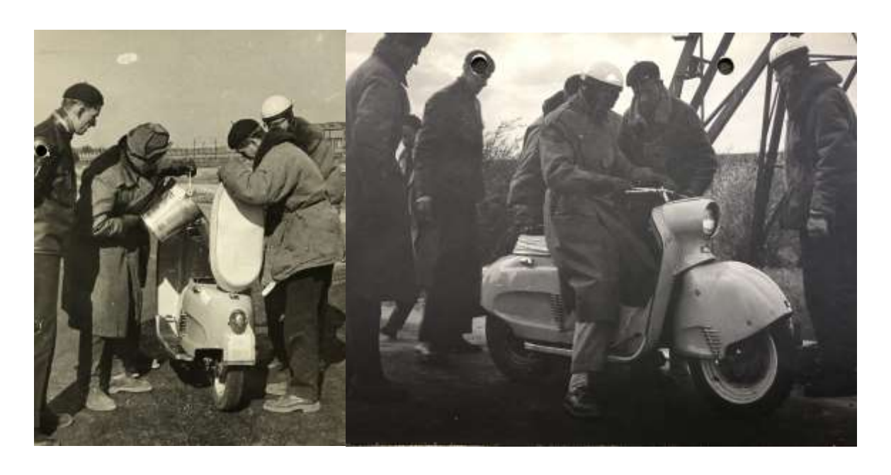
Two photos for the 1,5000 km in 24 hours at Osa