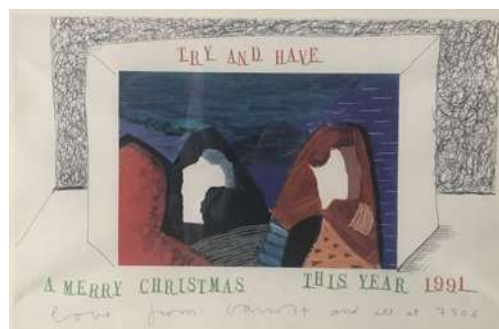
Merry Christmas from Hockney 1991