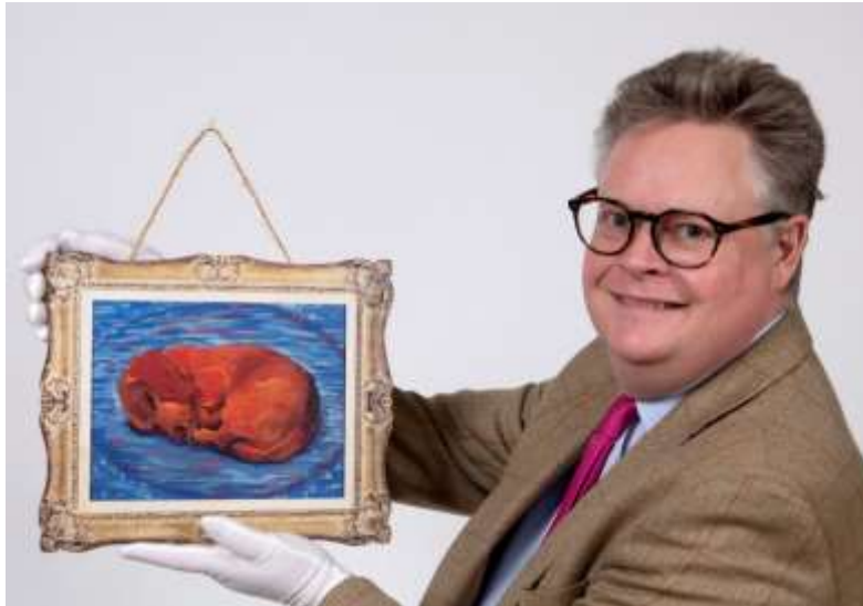
Hockney's Little Stanley

There is also a charming cut out of Stanley, Hockney's beloved dog. Dedicated to the reverse "Dearest Ann, Here is a picture of little Stanley sleeping, to hang up straight away – or it can be thrown away, much love, David", there is also an amusing little drawing giving Ann instructions how to hang to the picture.