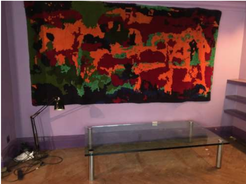
The wall hanging/rug