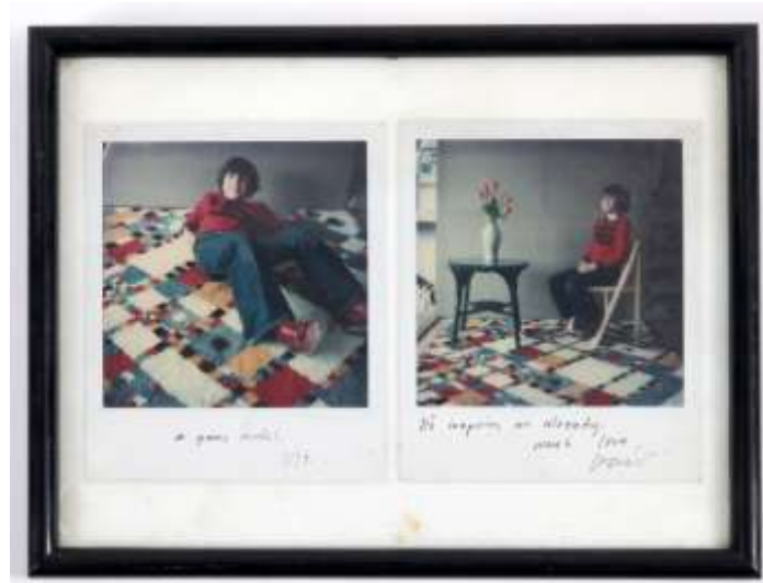
Byron Upton Polaroids

"It's inspiring me already-Much love David". This pair of Hockney Polaroids are estimated at £500 - £1,000.