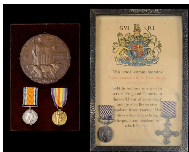
Father and Son Medals