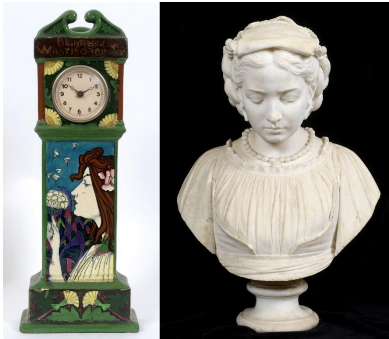
A table top Foley Intarsio table top clock and Late 19th century Italian carved marble bust

Charterhouse, who were instructed by the executors to clear the property, spent days wrapping, packing and removing items dating from the 18 th to 20 th centuries to their Sherborne salerooms. The items were then sorted, entered into the appropriate specialist sales and catalogued. In addition, many items received a good dusting as they had not seen a cloth and polish for many years.