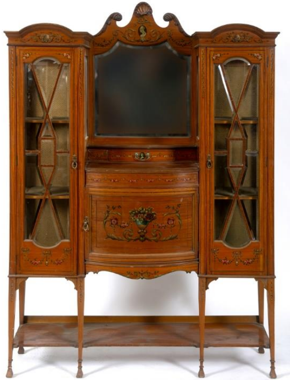
A late 19th century painted satinwood display cabinet