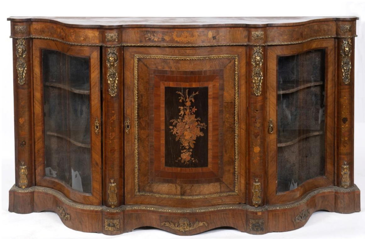
A Victorian floral marquetry inlaid credenza £600-1,000.

There were thousands of pieces of pottery, porcelain, glass, pictures, furniture, silver, jewellery, books, dolls, copper, brass, items of militaria. Every surface, including the walls and kitchen work tops, housed and displayed the owner’s treasures.