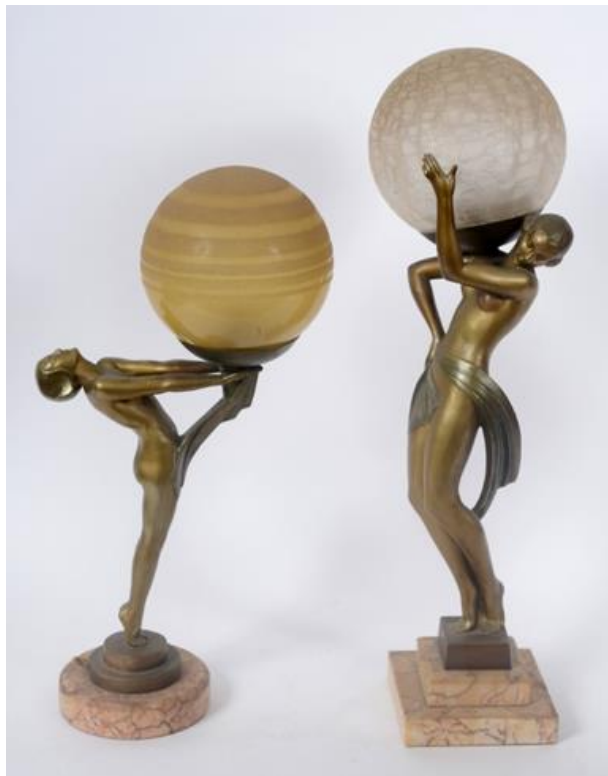
Two Art Deco lamps