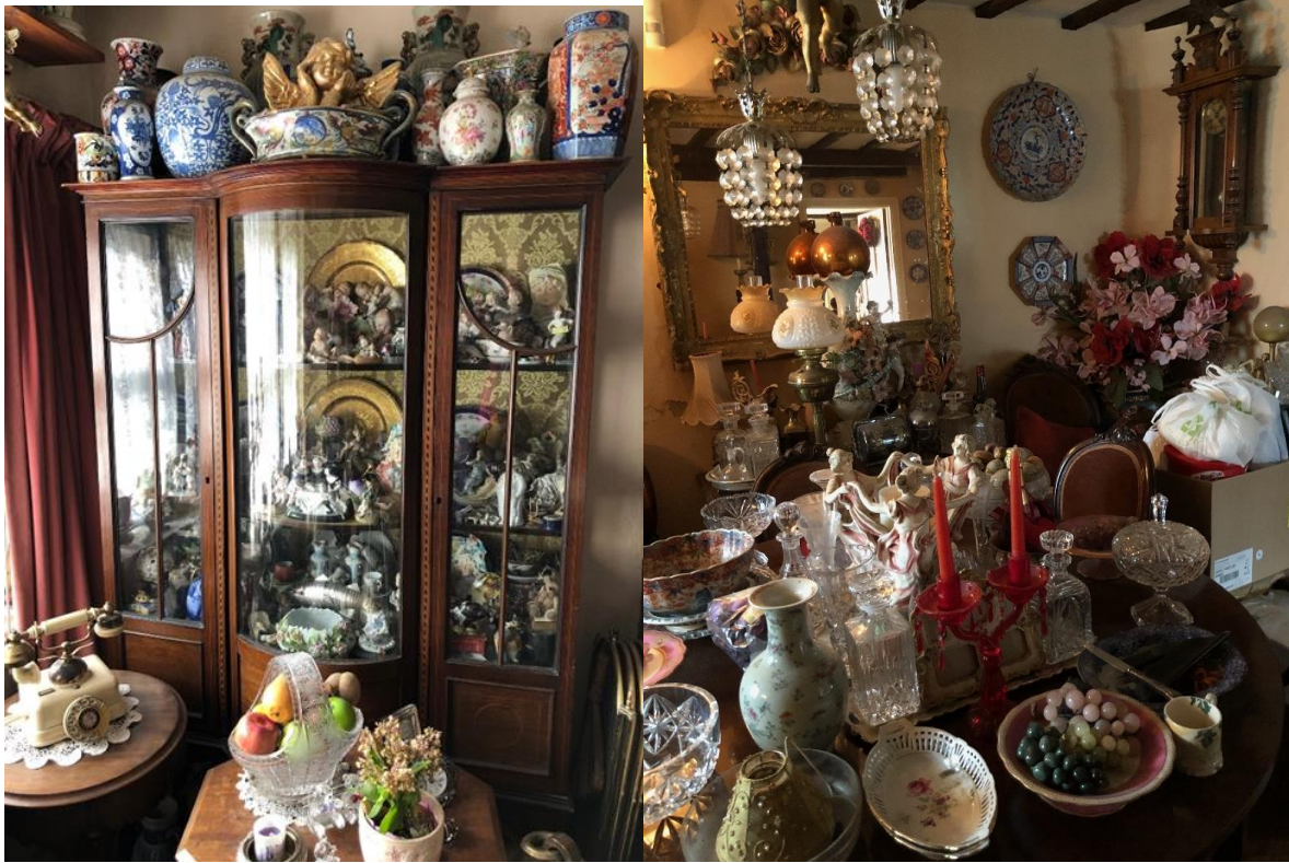
Selected views of some of the cottage's contents.

The contents of a Somerset cottage, entered into the Charterhouse March 14 th & 15 th auction, has revealed a lifetime obsession of collecting.