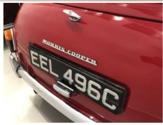
1965 Morris Mini Cooper