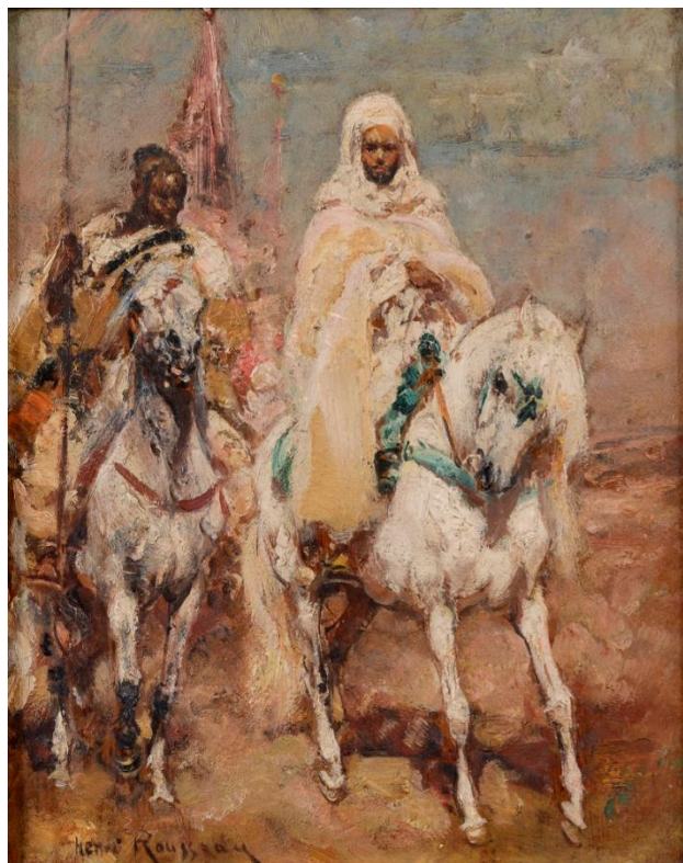
Henri Emilien Rousseau £1,000-£2,000* *plus 24% Buyers Premium including VAT