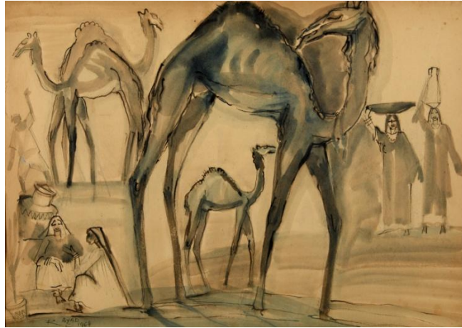
Ragheb Ayad £1,000-£2,000* *plus 24% Buyers Premium including VAT

Entered into the auction from Dr Farsi are nearly 100 pictures estimated from £100 to the low thousands. Artists from Europe and Egypt include Ragheb Ayad, Henri Emilien Rousseau, Kamel Moustafa, and Ahmed Sabri.