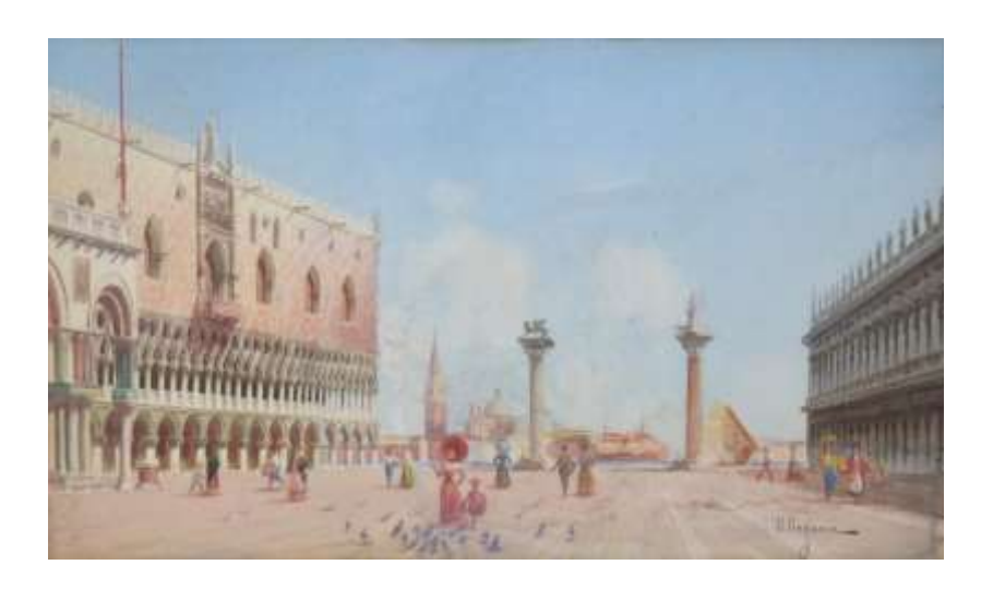
Umberto Ongania, watercolour, St Mark's Square, Venice, watercolour