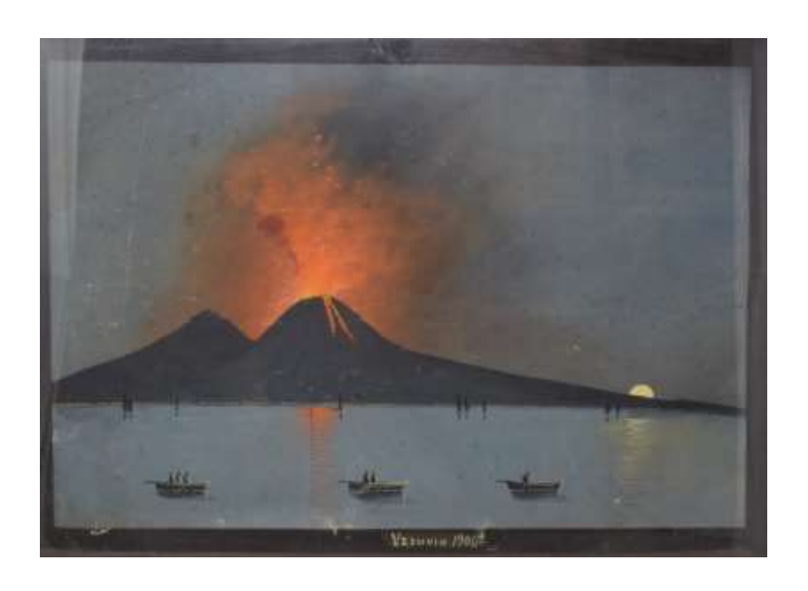
Neapolitan School, Vesuvius erupting 1906, gouache

There are views including Vesuvius erupting at night in 1906,