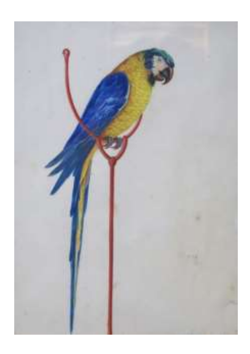
English school, 1936, study of a parrot, watercolour

This shows a rare insight into Victorian seaside life with two bath-changing machines. There is also a watercolour drawing of a handsome looking parrot, probably a favourite pet. Sadly the signature is indecipherable, but you can read the 1936 date.