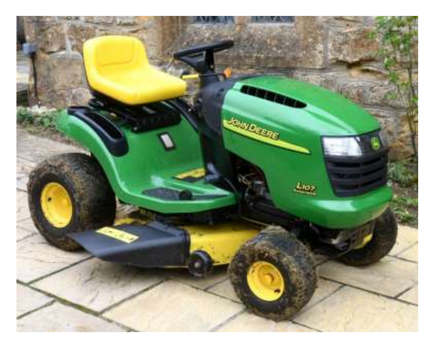
John Deere ride on lawn mower

There is even a John Deere ride on lawnmower £400-600!