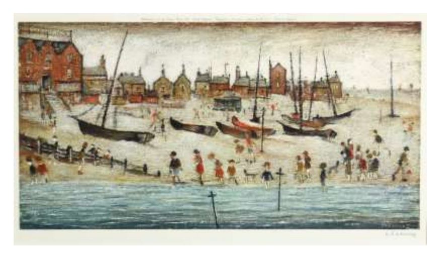
Laurence Stephen Lowry signed print "The Beach." An 18<sup>th</sup> century watercolour of Greenwich £100-£200, a 1653 Holy Bible £150-£250- see below.