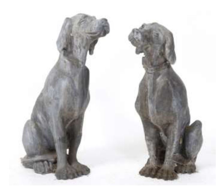
Pair of lead garden dog figures.

A pair of lead garden figures of dogs £200-£300 -