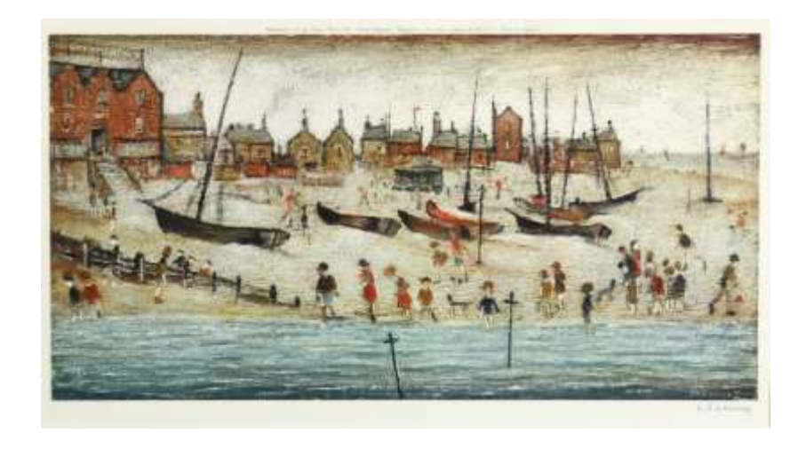
L S Lowry print £800-1,200 (Somerset Rectory)

However, it is not just old house which hide antiques away. Also in the auction is the contents from a recently built town house in Taunton which Charterhouse were instructed to clear.