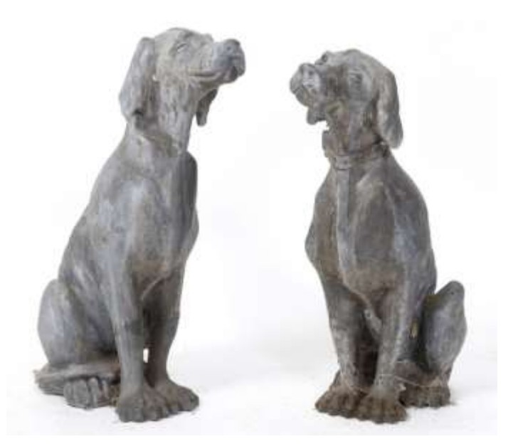
Pair of lead figures of dogs £200-300 (from an old Somerset Rectory)

From an old Somerset rectory there are a large amount of furnishings. Here, there is period 18<sup>th</sup> and 19<sup>th</sup> century furniture through to a pair of 18<sup>th</sup> century style lead dogs which stood guard in the hallway and a late 20<sup>th</sup> century L S Lowry print of a beach scene.