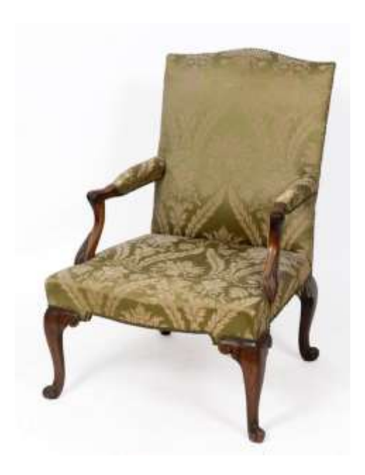
Gainsborough style library armchair £1,000-1,500 (Somerset Rectory)