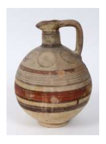
7<sup>th</sup> century BC Cypriot