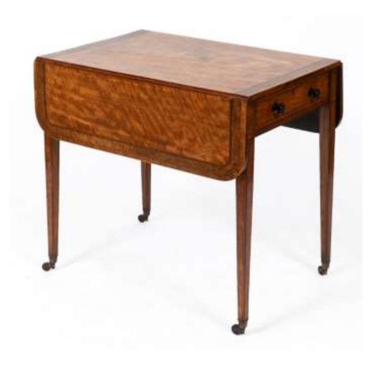
George III satinwood Pembroke table £300-500 (modern Taunton townhouse)

Lots removed from this property include a collection of 17<sup>th</sup> century and later maps, a fine George III satinwood Pembroke table and a pair of late Regency hall chairs, the likes of which would usually have graced the interior of an old country house rather than a nearly new property.