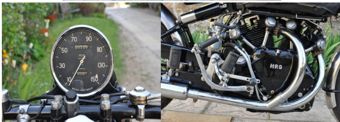
The 1949 HRD Vincent Black Shadow Series C

The Charterhouse Black Shadow was bought by the owner as a box of bits in 2008 and he spent the next year fully restoring the Vincent. It was known to be last on the