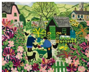
Vanessa Bowman, The Garden, Full Summer Oil on card, £1,950