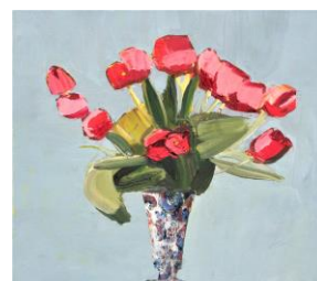
Mhairi McGregor Tulips Oil on canvas, £4,600