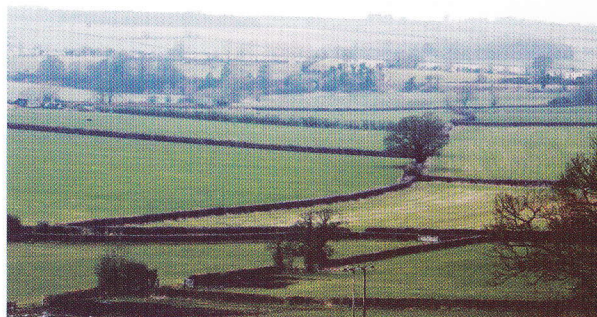
View of Old Bowden Way crossing foreground with Barrow Hill fort beyond the railway