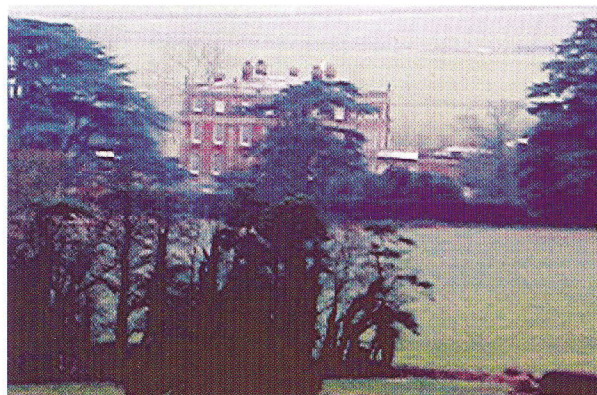
Ven House – Zoom from East Hill

7. Cross North Street - the Town Hall is opposite at the crossroads. The ancient building is the meeting place for the Parish Council and also the Women's Institute. TL at the Queens Head into East Street and back to the car park.