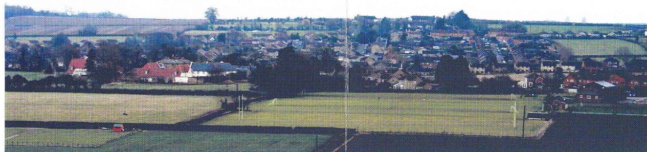
Panorama - Milborne Port School to Kingsbury Regis